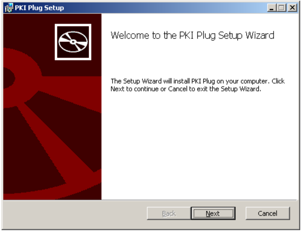
Figure 1 PKI Plug Setup

By default, the plug-in is installed to the following directory: