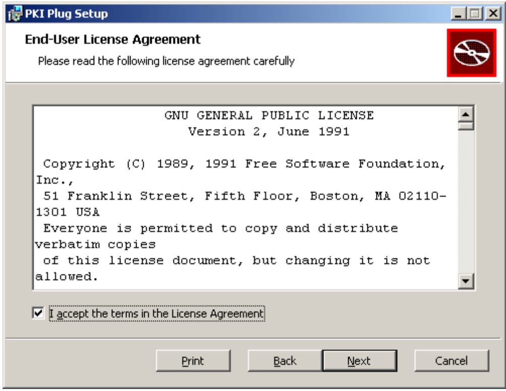
Figure 2 End-User License Agreement

Click the Typical button for typical configuration on the third dialog.